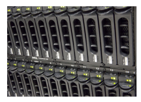
Secure Data Storage